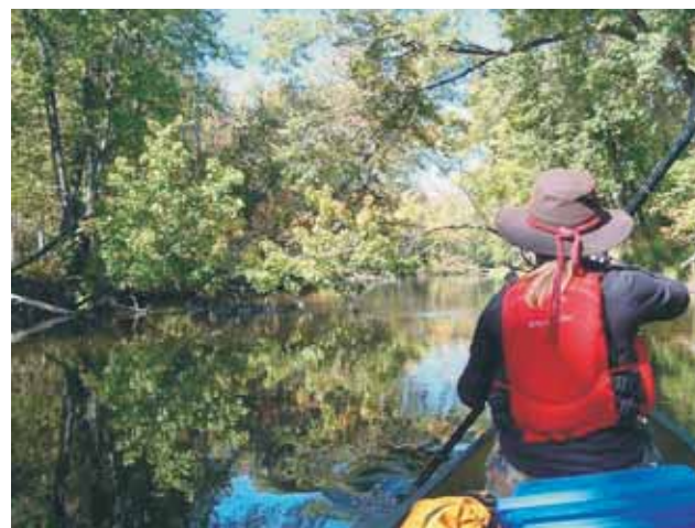
Paddling down the York River by Clive Emery

On the west shore of the marsh is the abandoned Craigmont Corundum Mine which is an excellent place for a good hiking adventure. The mine once supported the mill and refinery of the largest corundum mine in the world and the largest crushing mill in North America. The road sparkles in the afternoon sun with traces of mica from the tailings from the refinery which once processed 200 tons a day. To the north is the town of Combermere, and to the East is the raging white water of The Madawaska River, populated by white water kayakers all season long, this flows into The Ottawa River and eventually The St. Lawrence.