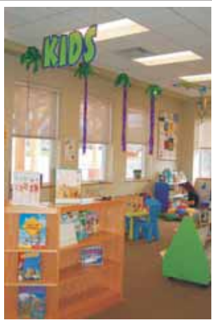
The Children's Corner

It has been an exciting time for patrons, board members and library staff since our new facility opened last August. We have a warm and inviting space and plenty of room to add to our library collection plus the bonus of our Program Room which has been a