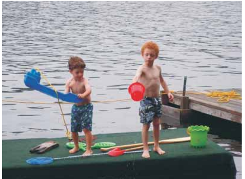
Kids on the Dock by Peter Brown

Currently a significant number of Baptiste Lake residents are members of the BLA and we are extending an open hand to non-members to come on board. The BLA continues to be active in activities to